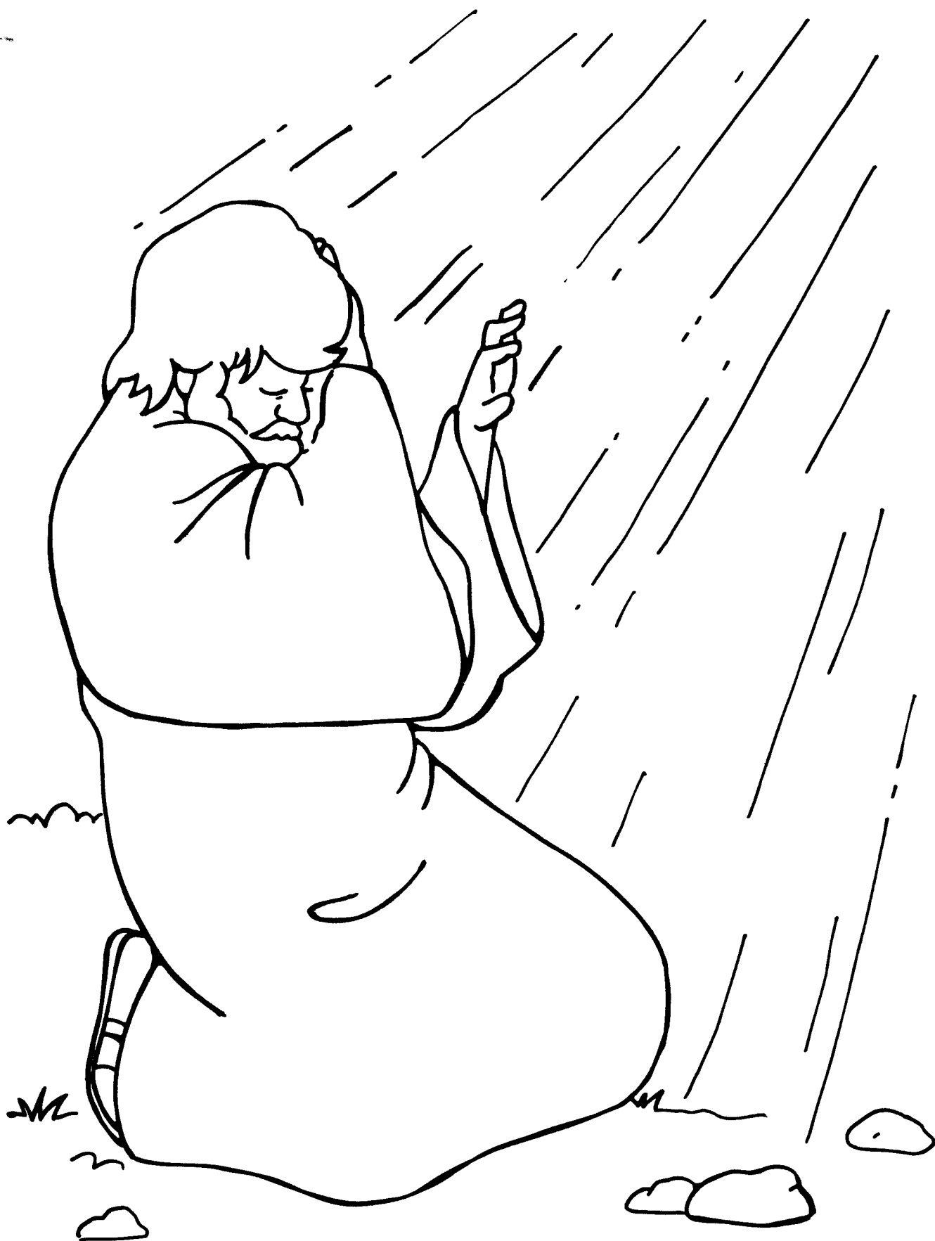
Paul Begins to Tell About Jesus Acts 9, 22