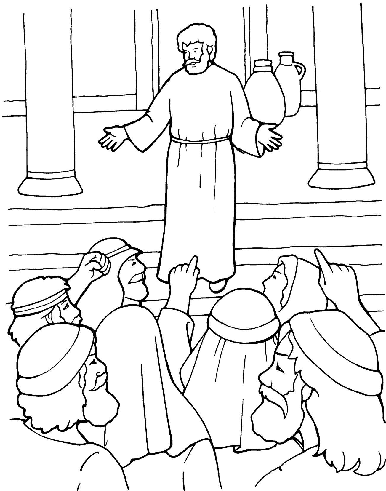
Paul Tells a Crowd About Jesus Acts 21, 22