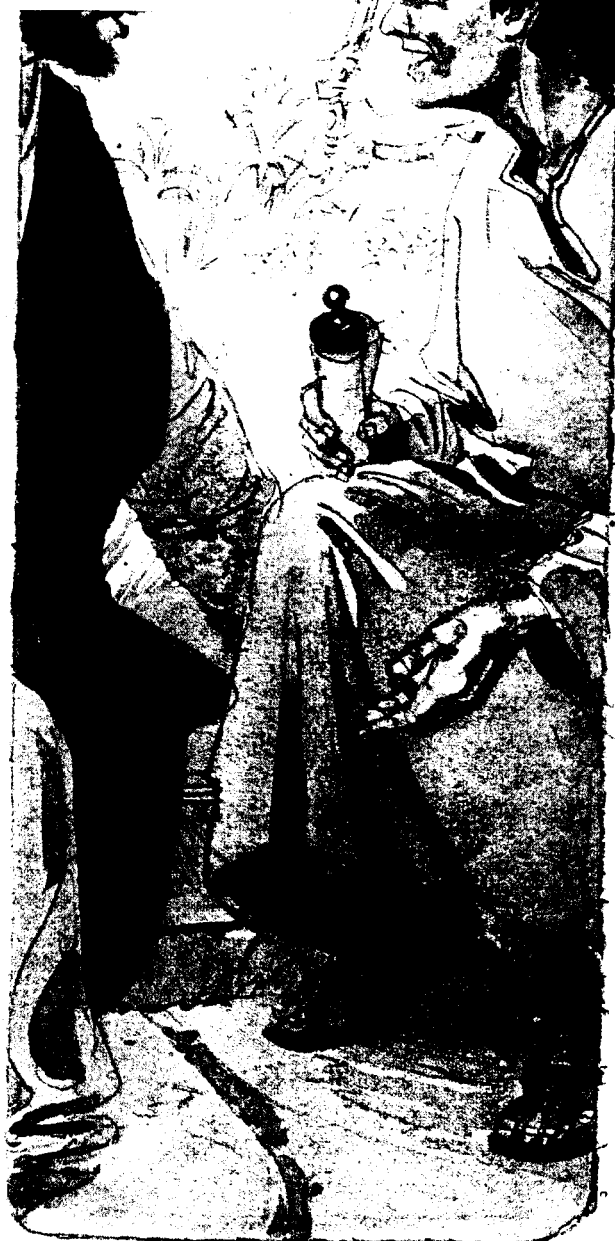
The letters Timothy received from Paul are now part of our New Testament.

During the closing years of Paul's life, Timothy was in Ephesus, serving as pastor and leader of the churches there. Two books of the New Testament—I and II Timothy—are letters that Paul wrote to